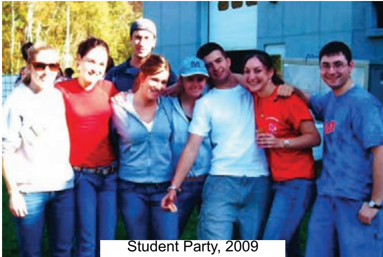
Student Party, 2009