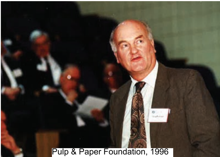
Pulp & Paper Foundation, 1996