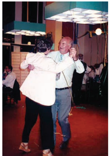
Student Party, 2001