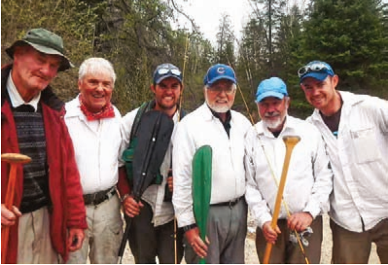
Boundary Waters, May 2013