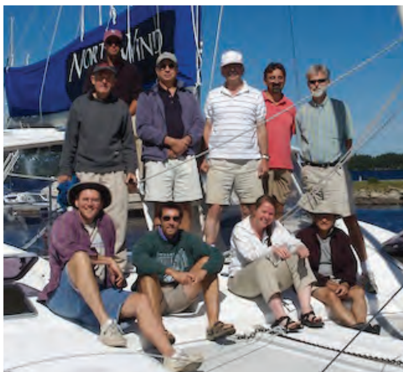
2007 Faculty Retreat